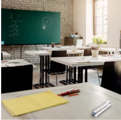
Offices / Class Rooms