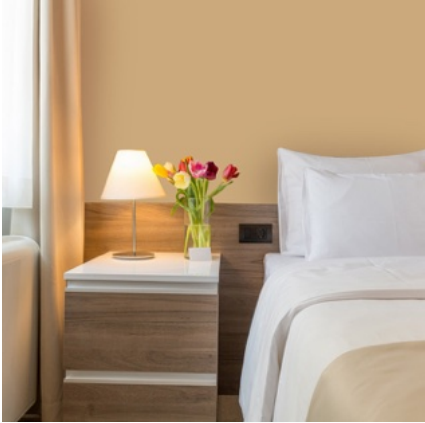
Assisted Living Facilities / Hospitals