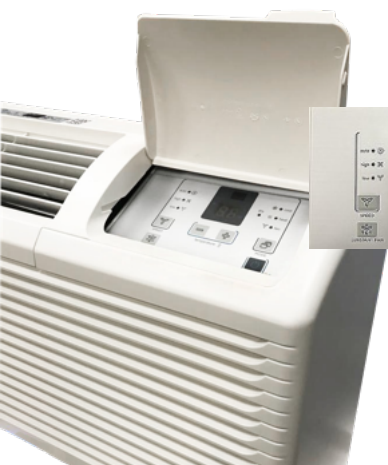
PTAC Control Display

Choose which control option works for you*