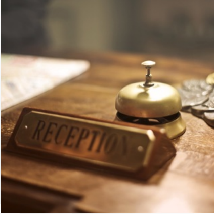
Hotels / Motels